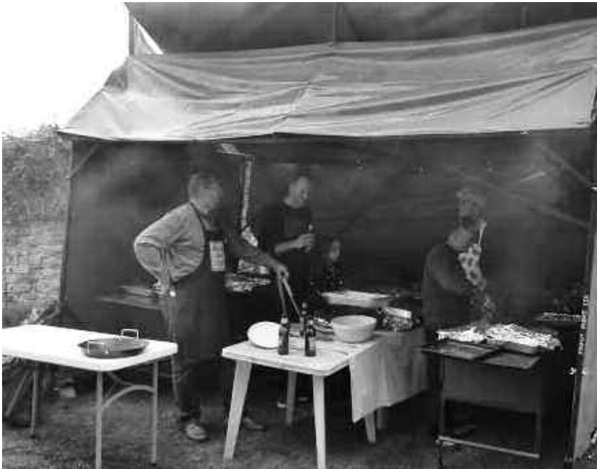
Chefs in the rain

Lastly but by no means least a special thank you to the attendees who helped to make the event a great success. All in all a very happy and successful event. Hopefully see you all next year!