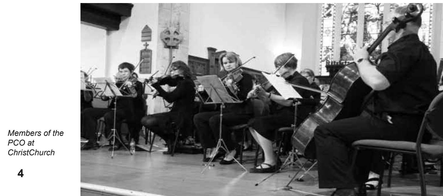
Members of the PCO at Christ Church

The following pieces were played at the Christ Church concert: