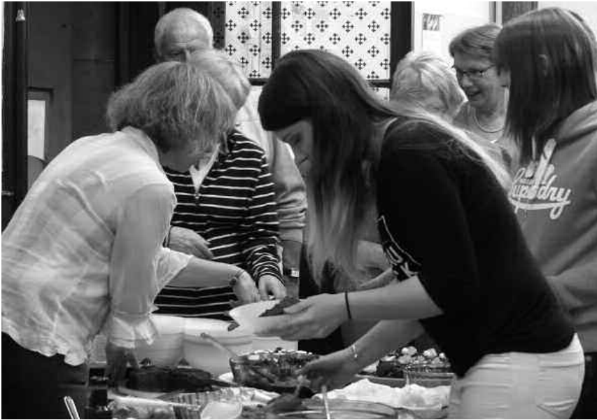
Puddings proving popular