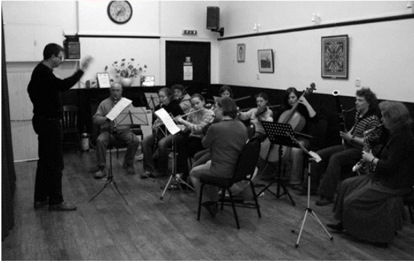
Playing by Ear in the Village Hall ca 2007