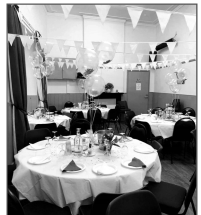
The hall set up awaiting the guests.