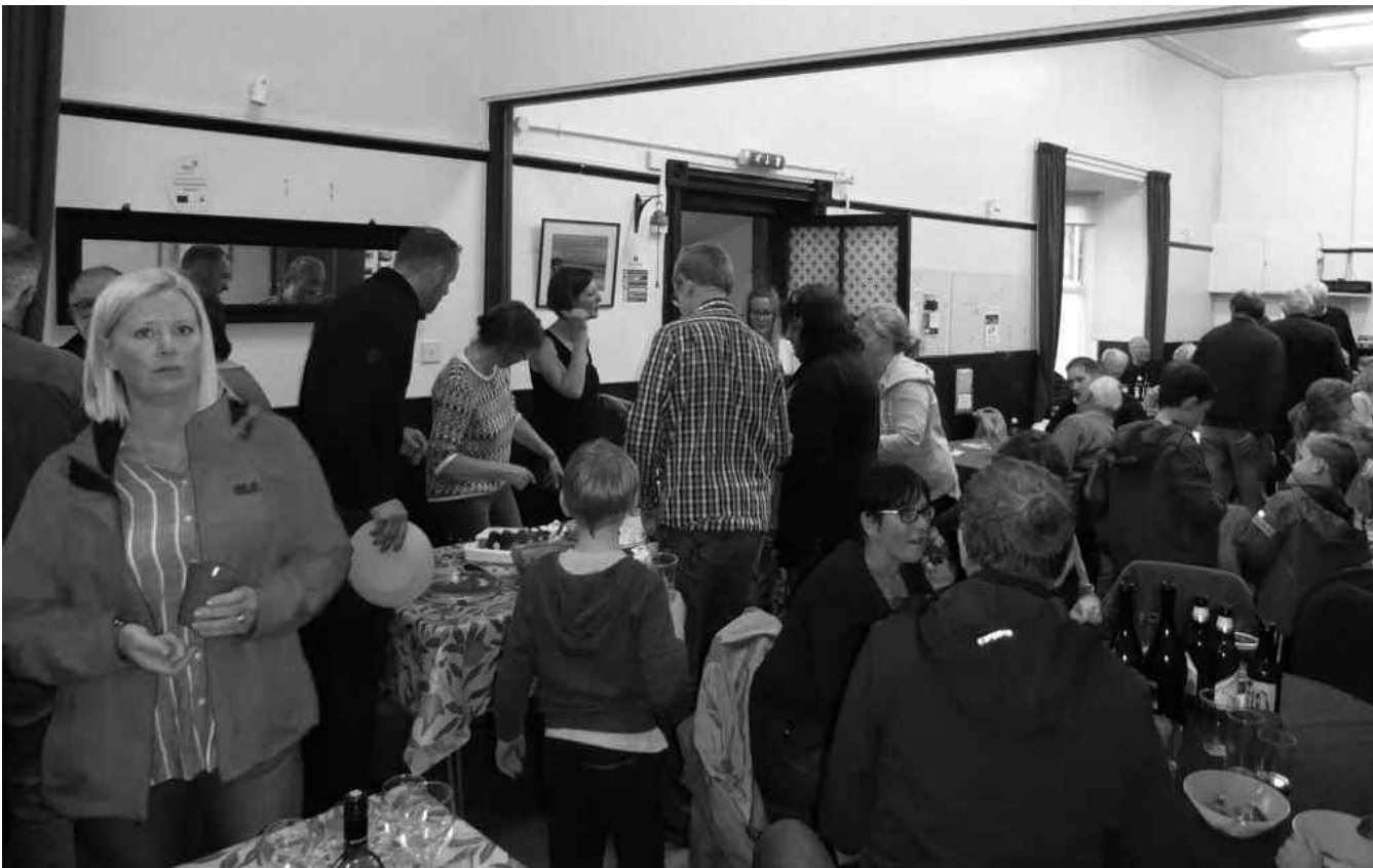
A busy night at the barbeque - avoiding the rain