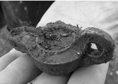
Some of the smaller finds from this year's Broomlands dig