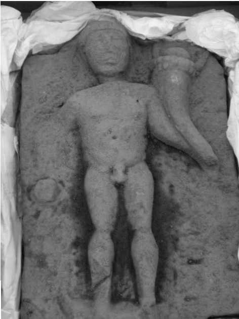
A significant find of a carving of a local god

Representative from the Lottery Fund visited today and was very impressed by the site, organisation, volunteers and finds – money well spent!