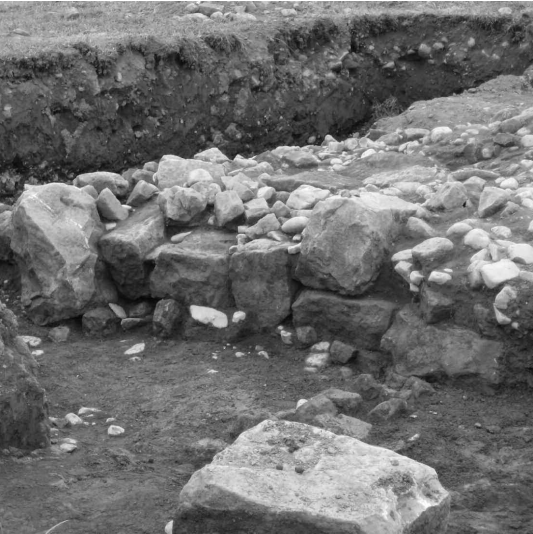
Potential base of bridge pillar

26th Sept We now have three enclosure ditches on the main site and a large pit consisting of broken roof tiles and window glass. This is evidence, at least, of a high status building, such as a temple, that has been lost under the old railway line or Low Road.