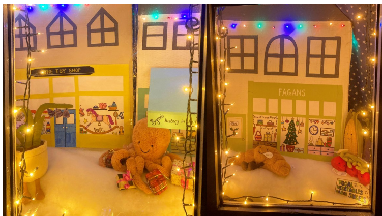
The winner Ordgarff